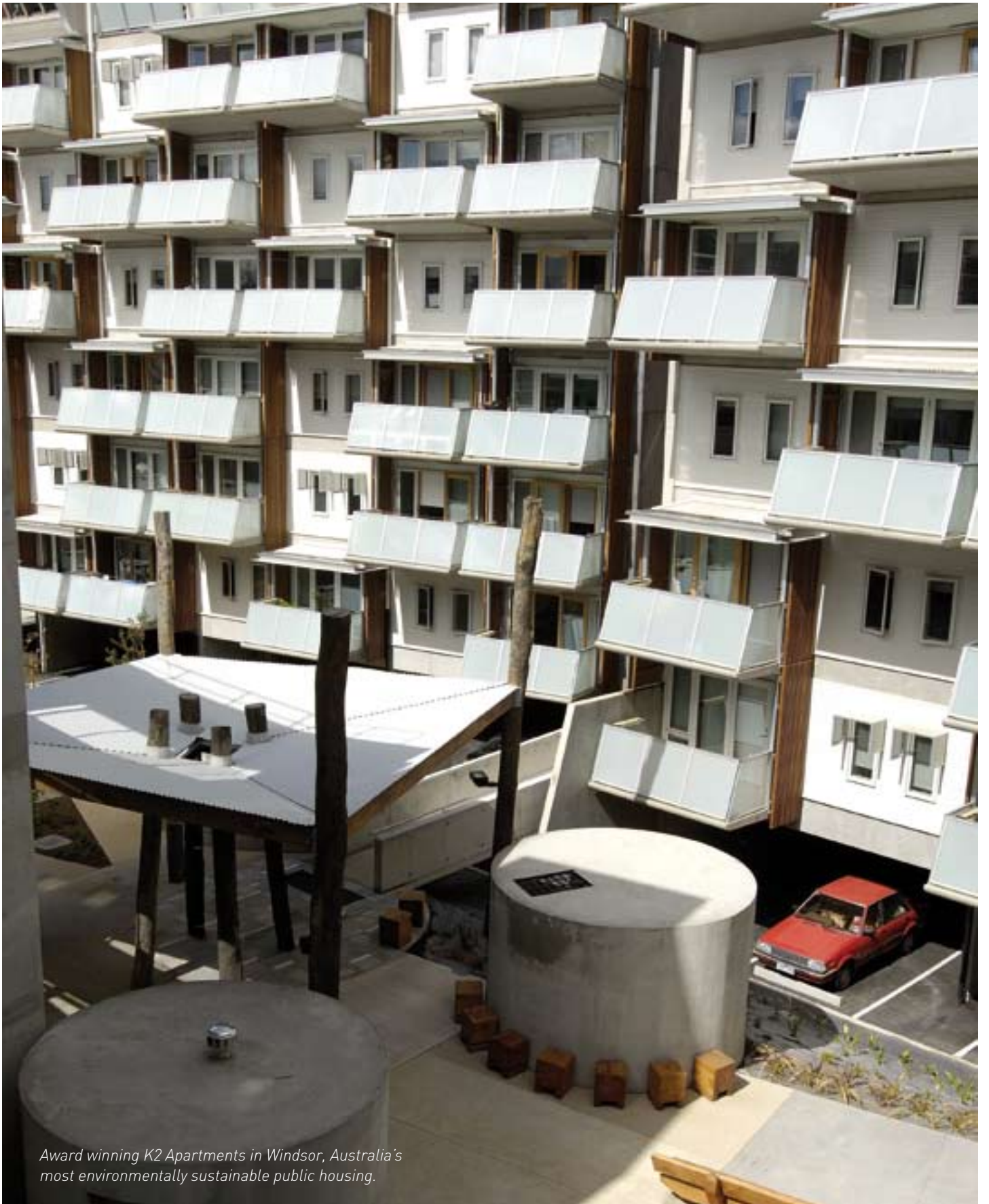
Award winning K2 Apartments in Windsor, Australia's most environmentally sustainable public housing.