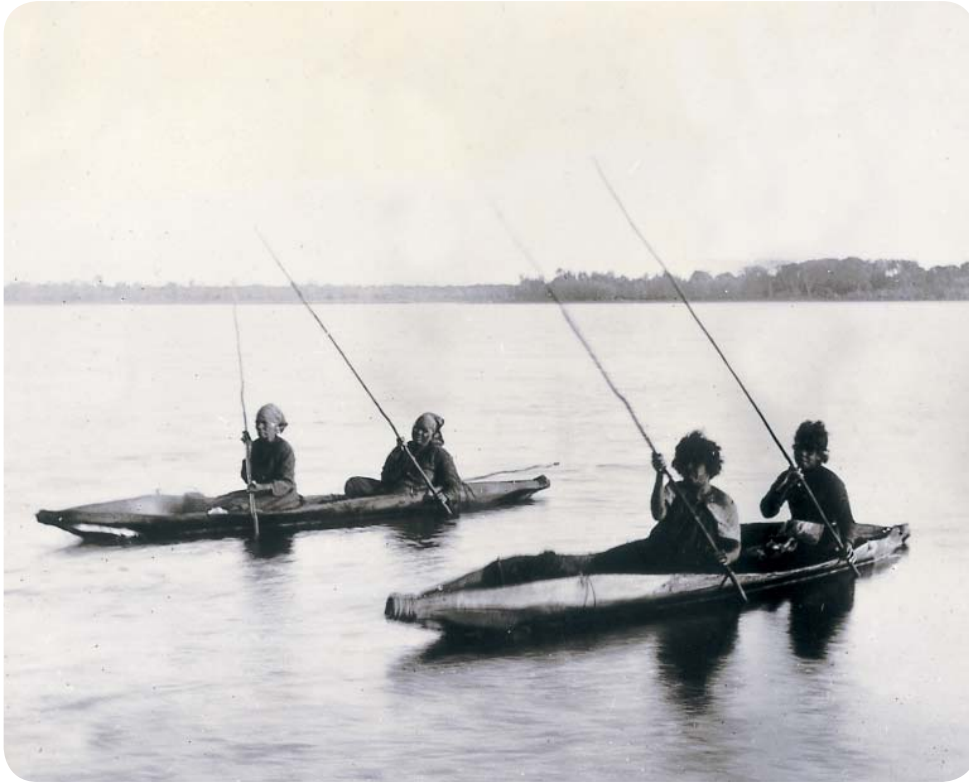
Aboriginal people in canoes on Lake Tyers 1886