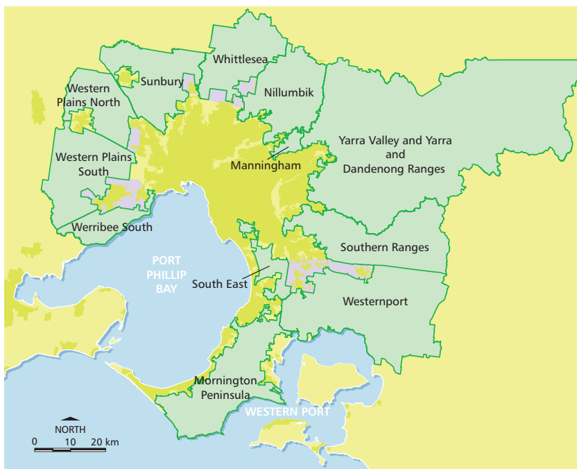
Figure 1. Green wedges

Green wedge Existing urban area Growth area