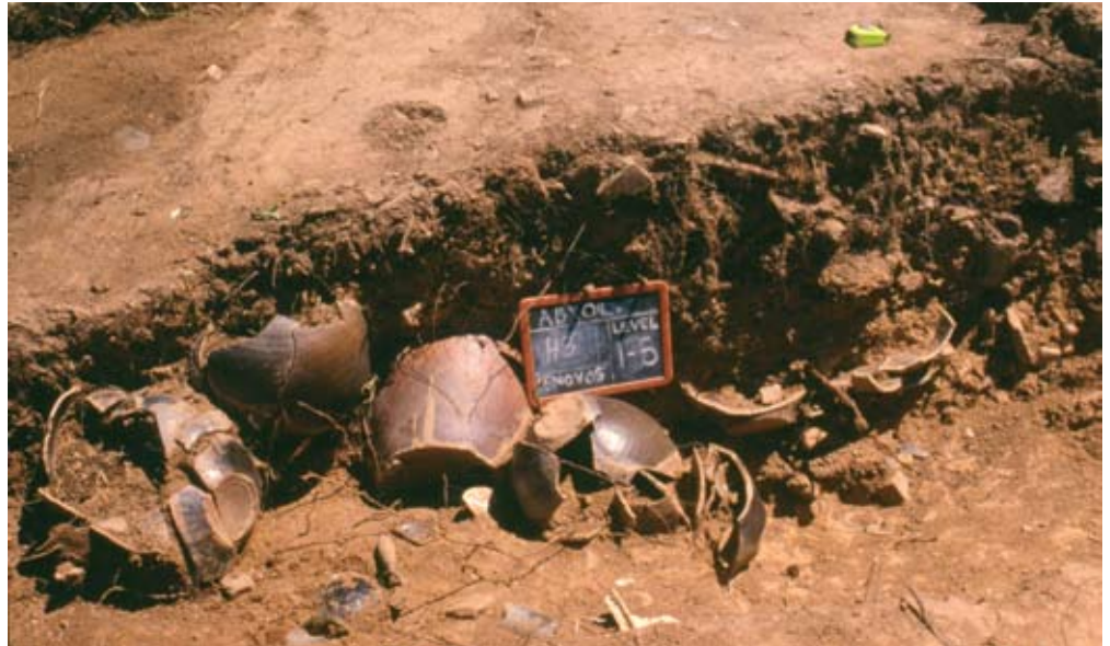
Stoneware jars, Chinese Kiln, Bendigo North