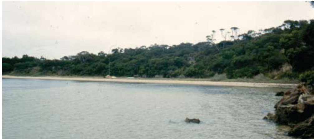
Collins Settlement Site. This sheltered location was strategically chosen in 1803 because of its proximity to Port Phillip Heads.