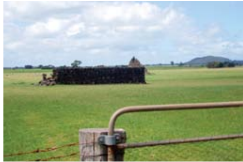
Herrnhut Utopian Commune, Penshurst

The visible remains at Herrnhut consist of the scattered ruins of Krummnow's house, the dining room, vestiges of the dormitory and the cemetery. There are two massive Lombardy Poplars, Populus nigra , immediately adjacent to Krummnow's house and Radiata Pines marking the cemetery.