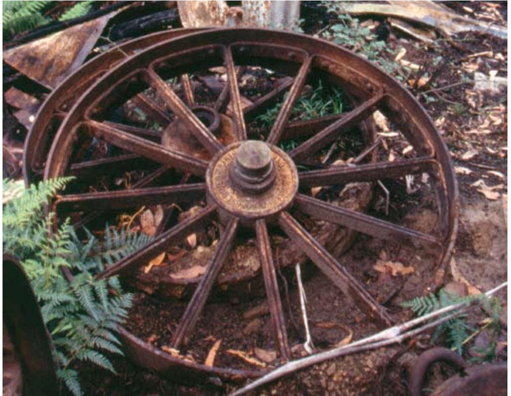
After the 2003 bushfires it was an opportune time to discover previously concealed archaeological features. Boiler wheels, Mt Moran.