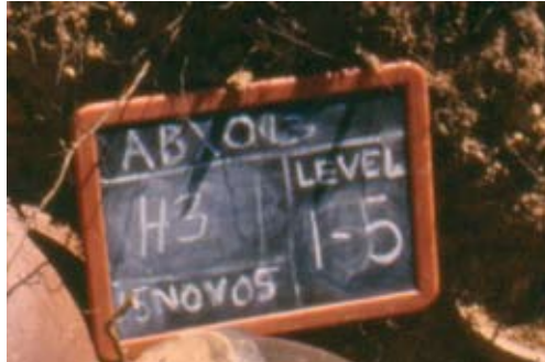
A photographic board in use at the Chinese Kiln site, Bendigo