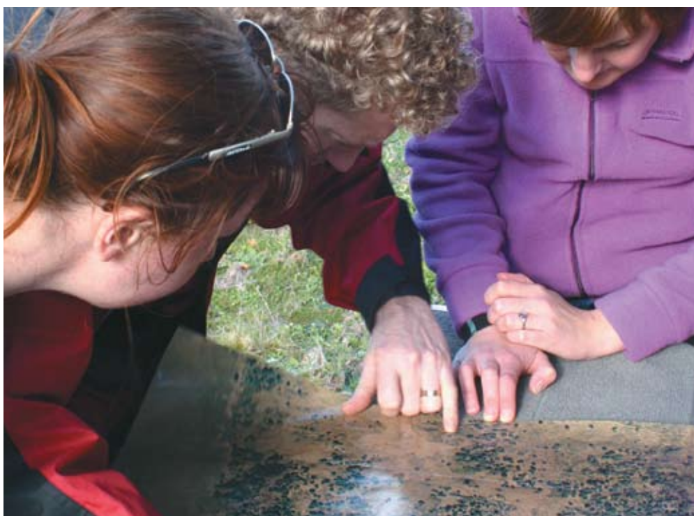
Aerial photographs assist in the planning of survey strategies.

Note: it is anticipated that Heritage Victoria will move to an upgraded mapping system in the near future. Until that time, all GPS coordinates must be expressed using the AGD 66 system.