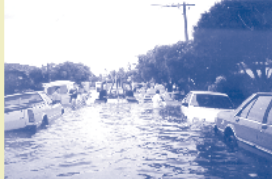
Footscray main drain, December 1992

Larger floods are possible. The PMF is the maximum possible extent and height of flooding and defines the largest flood that could conceivably occur at a particular location and normally covers a greater area than the 100-year ARI flood.