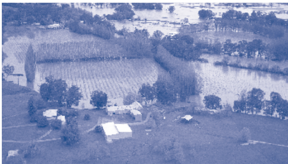
Whorouly East, Ovens River 1993 Flood

Land use planning is one mechanism that is used to minimise the risk of flooding to life and property. It is also a means of protecting the environmental values of the floodplain as part of an overall catchment strategy.