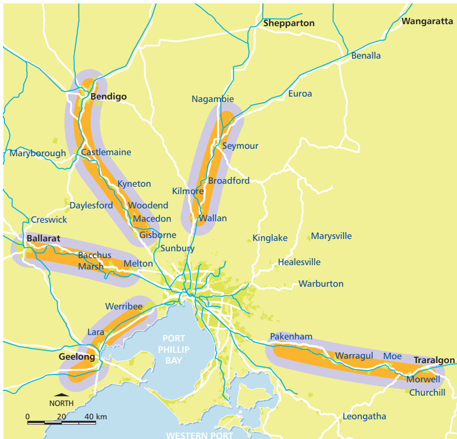
Figure 32. Regional cities and townships

Planning in and around the regional centres will be done in partnership with local councils and other key stakeholders. The planning process will be designed to include substantial community involvement.