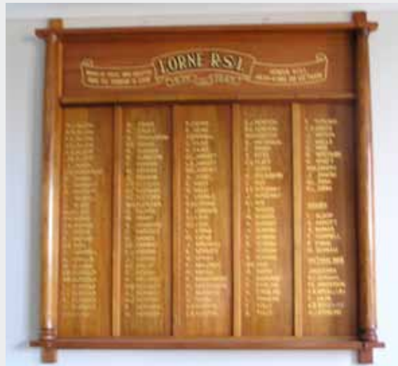
Lorne RSL Honour Board in the Lorne Senior Citizens' Hall.