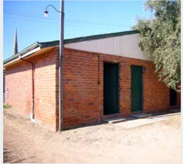
Storage shed at the rear of the hall.