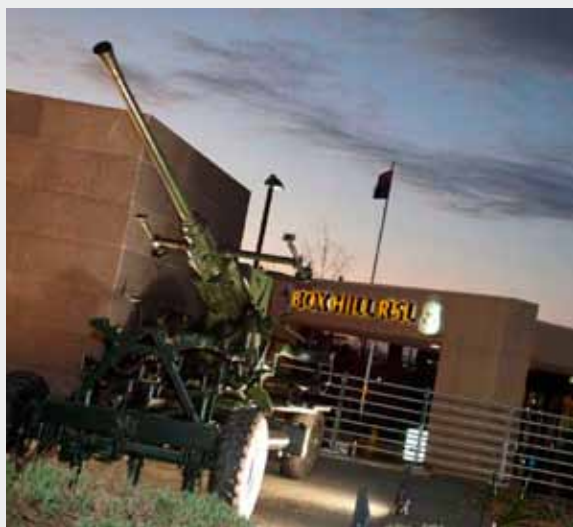
The Box Hill RSL

These items are catalogued on disc to share among other RSLs that might need certain items for loan on their displays. The memorabilia displays within the RSL are changed every three months with a different theme. The main large cabinet has depicted lots of conflicts and issues that are of importance to all Australians, such as a recent display based on the Vietnam conflict. It contains original memorabilia including the weapons used in that era. Once a display has finished, three months is set aside to source all information and material for the next display. Three dedicated people in the memorabilia department go to great lengths to put these displays together.