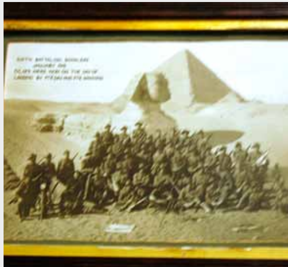
6th Battalion in Egypt, c.1916.