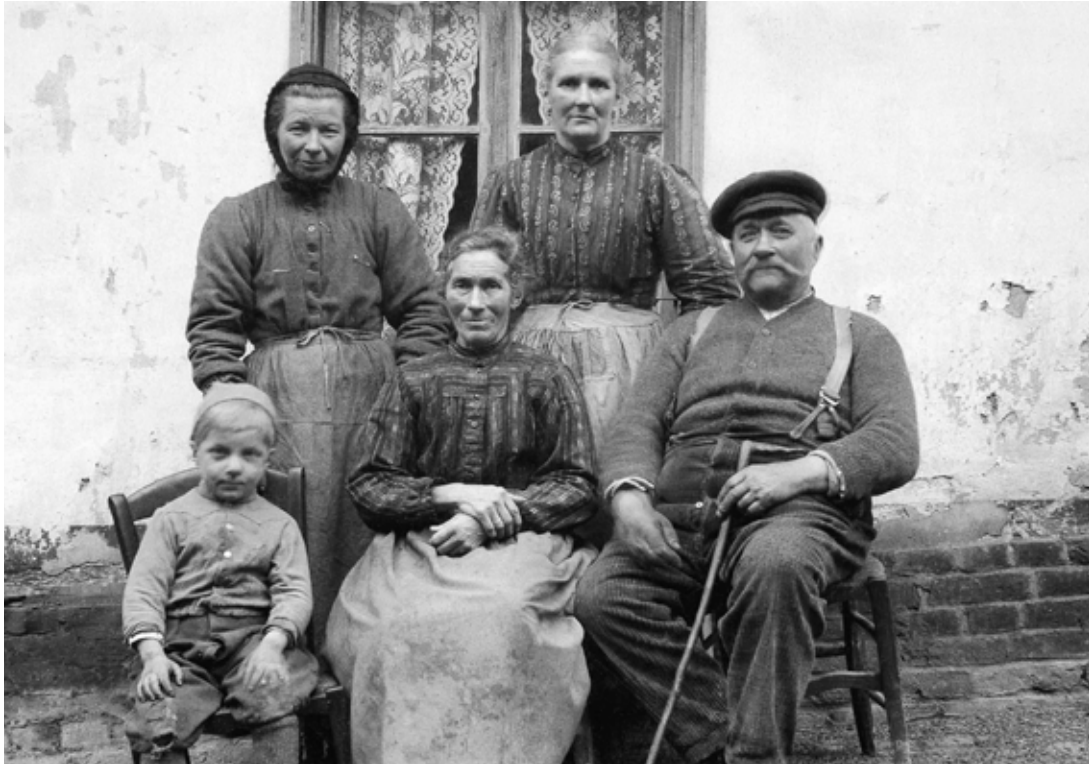
Left – Unknown Sergeant who was a Military Medal winner; Above – Unknown French Family in the village of Visme-Au-Val where the 38th Battalion were billeted.