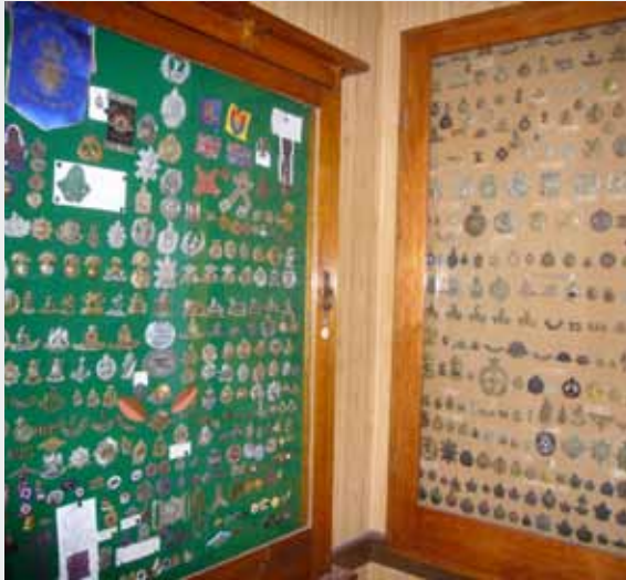
In the 'gun room' a display of insignia in wall-mounted glass-fronted cases.