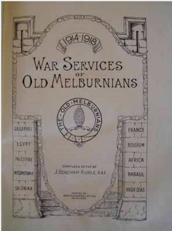
Front page of the Melbourne Grammar School publication, War Services of Old Melburnians.