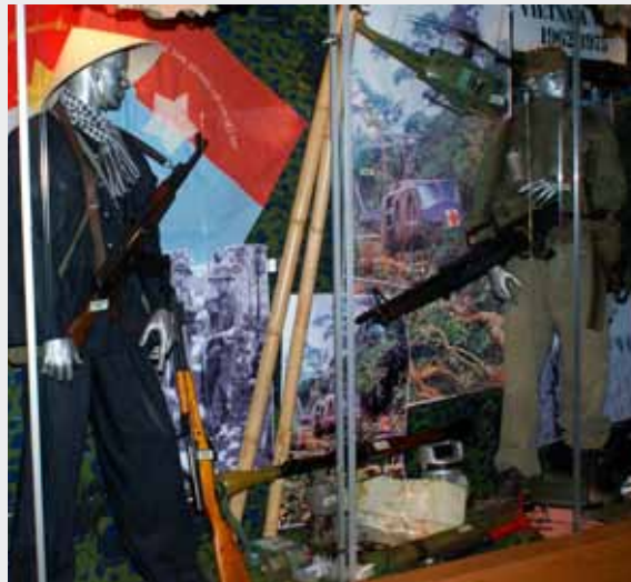
Vietnam War Display, Box Hill RSL