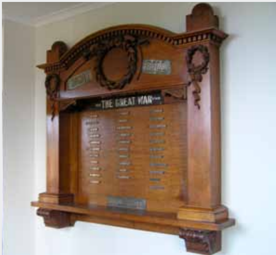
Lorne State School Great War Honour Board in the entrance to the Lorne Senior Citizens' Hall.