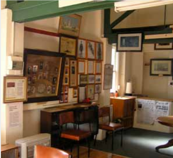
View of First World War collection.