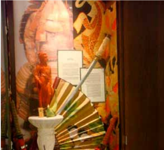
The Japanese Cultural Display, Box Hill RSL