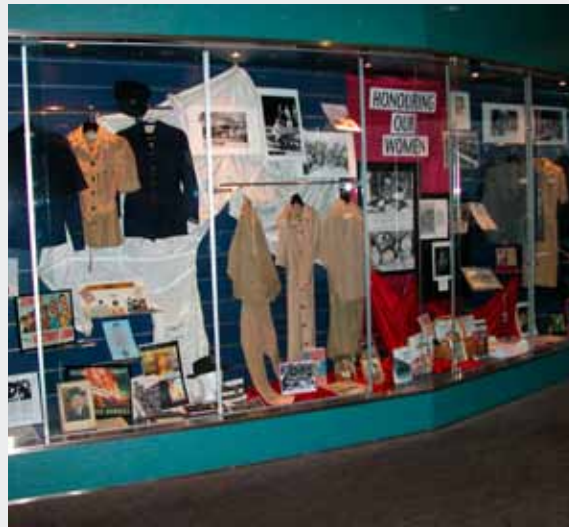
Women in the Services Display, Box Hill RSL