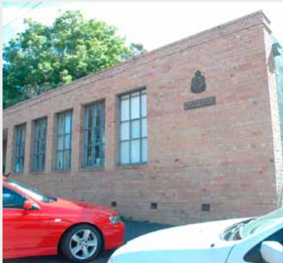
Former Lorne RSL Hall, Smith Street, Lorne.

The Lorne RSL Sub-Branch was formed in 1940. In the early years, it boasted ninety-six members. In the 1950s, the Sub-Branch built a dance hall on a portion of the old library paddock fronting Smith Street. The hall became its clubrooms. Due to high maintenance and looming capital works costs, the Lorne RSL Sub-Branch sold the building to the Education Department in the mid 1990s. Plaques on the building today recognise its associations with the RSL and it now forms the Lorne P-12 College RSL Memorial Wing.