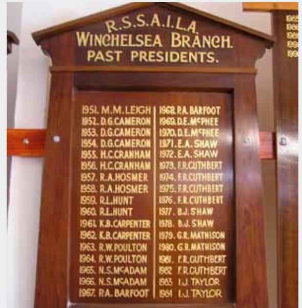
Detail of RSSAILA Winchelsea Branch Past Presidents Board.

Most private collections in the area, members felt, comprise medals, army caps, rising sun medals, mosquito nets, driver's caps and 'Yankie gaiters'. They are stored in envelopes in drawers or 'a box in the cupboard'. Most families, the members say, are very proud of their relative's memorabilia. There is increased interest by young people to learn more about the importance of the memorabilia and the associations of their relatives with it, and there is an increased interest in Anzac Day.