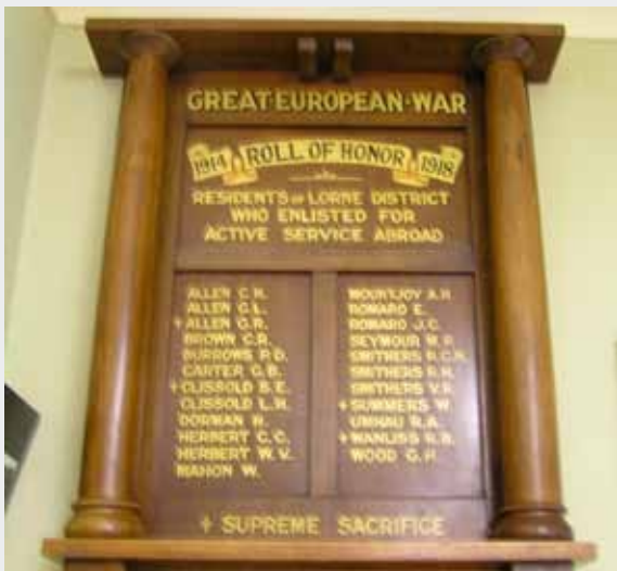
First World War Honour Board in the Lorne Historical Society.