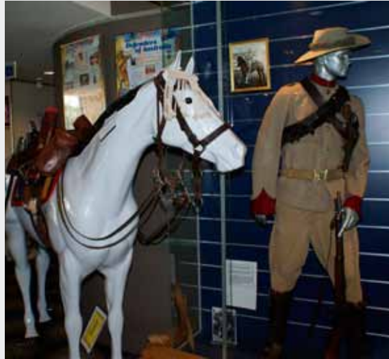
Light Horse Display, Box Hill RSL