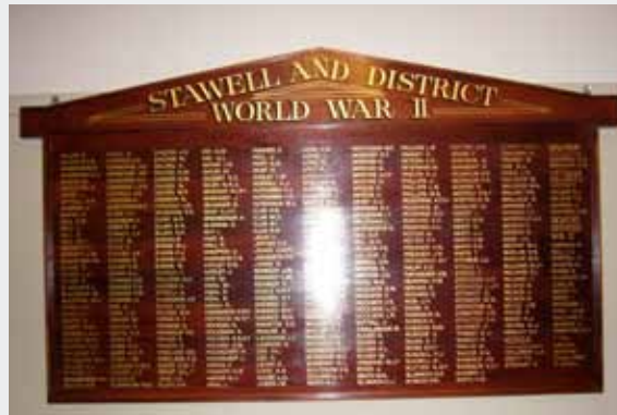
Stawell and District Honour Board, with about 400 names, in the main hall.

Although they recognise the need, the sub-branch members have not undertaken any training in conservation or archival collections, as it is difficult to find members to undertake such training, nor are they aware of support services and networks. As this organisation does not wish to close, priority has not been given to developing agreements for caring for the collection if the group disbands.