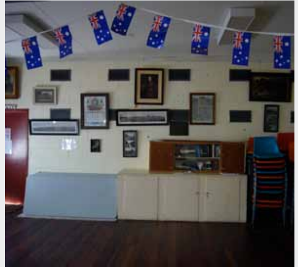
The east wall in Dimboola RSL Hall. The theme is World War One.

Memorabilia is important to local families and is often retained within families down the generations. Privately kept memorabilia, known to the Sub-Branch, consists of photographs, diaries, letters and medals. More dangerous items, such as live shells and firearms, have been handed in. Sometimes material is framed, other material is kept in boxes or cases. Many veterans leave instructions about their memorabilia in their wills and it usually stays in the family. Sometimes deceased ex-servicemen are buried with their medals.