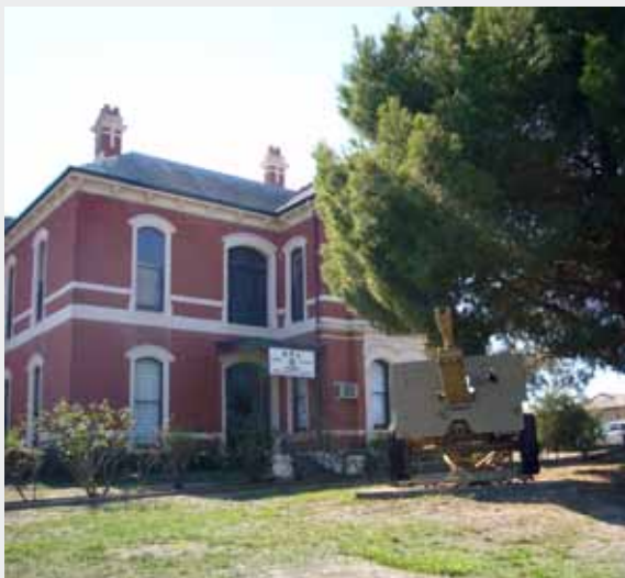
Stawell RSL Memorial Hall with a 25-pounder howitzer, a Lone Pine tree and (at far right) a Bofors anti-aircraft gun.