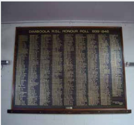
The large World War Two Honour Board on the south wall in Dimboola RSL Hall. The board is considered by the Sub-Branch the most significant item in the hall and is one of the hall's prime attractions for visitors