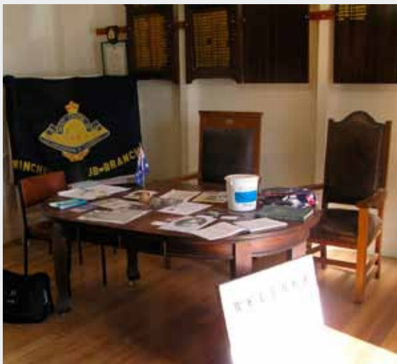
Presidential and Vice Presidential Chair and table.