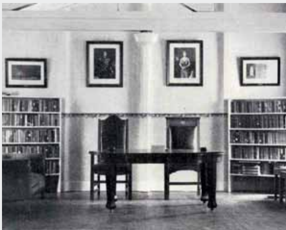
Winchelsea and District RSL Club Room, 1947, showing gifted memorial chairs for the President and Vice President.

The Winchelsea and District RSL Sub-Branch has gathered and maintained a collection of memorabilia and memorial furniture since its early years. Today, the Winchelsea and District RSL is served by a membership increasing in age, and declining in numbers. The RSL Sub-Branch rooms are opened upon request to the public, school and community groups and as part of Anzac Day commemorative activities.