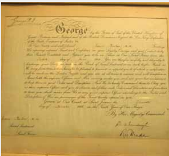
Certificate of promotion to the rank of Second Lieutenant, signed by King George V, 11 December 1918.