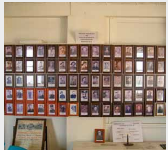
Detail of photographic portraits of Second World War soldiers of Winchelsea.