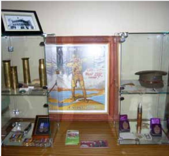
Glass display cases in the hallway showing examples of several collection categories: shell cases, medals, posters and uniforms. At top left is a photograph of the building 'Oban' early in the twentieth century.