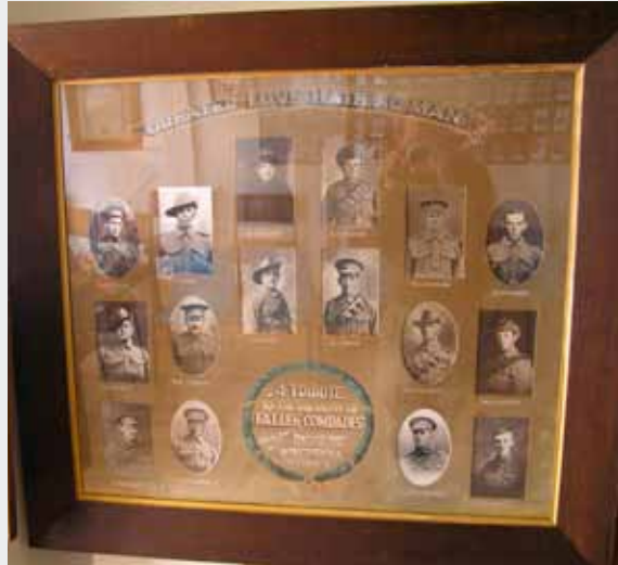
Detail of First World War Photographic Honour Roll