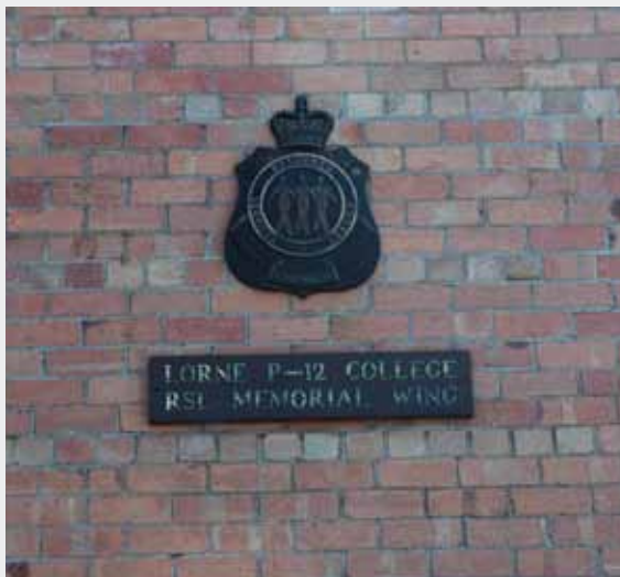
Detail of plaques on front wall of former Lorne RSL Hall.