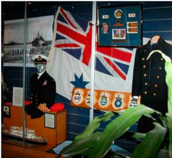
Navy Display, Box Hill RSL