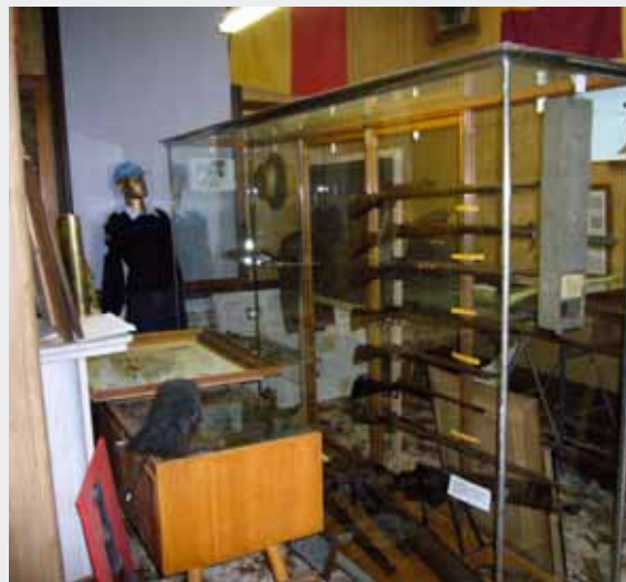
A popular exhibit on the ground floor, a glass case containing rifles and two machine-guns.