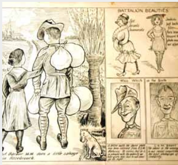
Battalion newspaper featuring caricatures including one of James Barker (left).