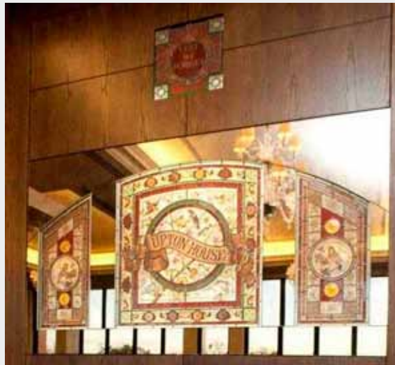
A reproduction of the stained glass windows in Upton House now stands out in the new Members Lounge. It cost $180,000 to have made including the "Stand To" emblem above in stained glass.

The Box Hill RSL Memorabilia Department is fortunate in that the President and Committee of the Sub-branch support the preservation and display of memorabilia. There are now two dedicated areas to store the memorabilia, with the latest being a purpose-built room. The Box Hill RSL invites all other RSLs within Victoria and interstate to visit, exchange information and view the collections.